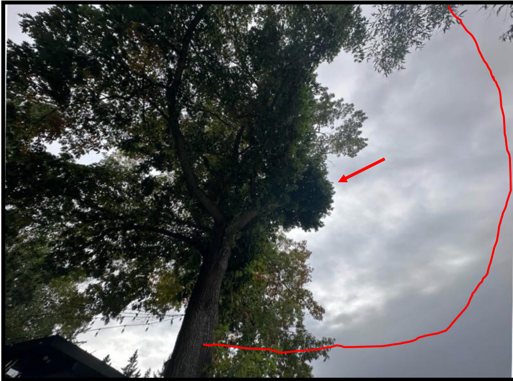
Photo 1: Red outline shows approximate area occupied by the topped stem. View is looking south. Image taken looking up from base of tree. Arrow points to end of stem that was topped close to the property line and is re-sprouting.