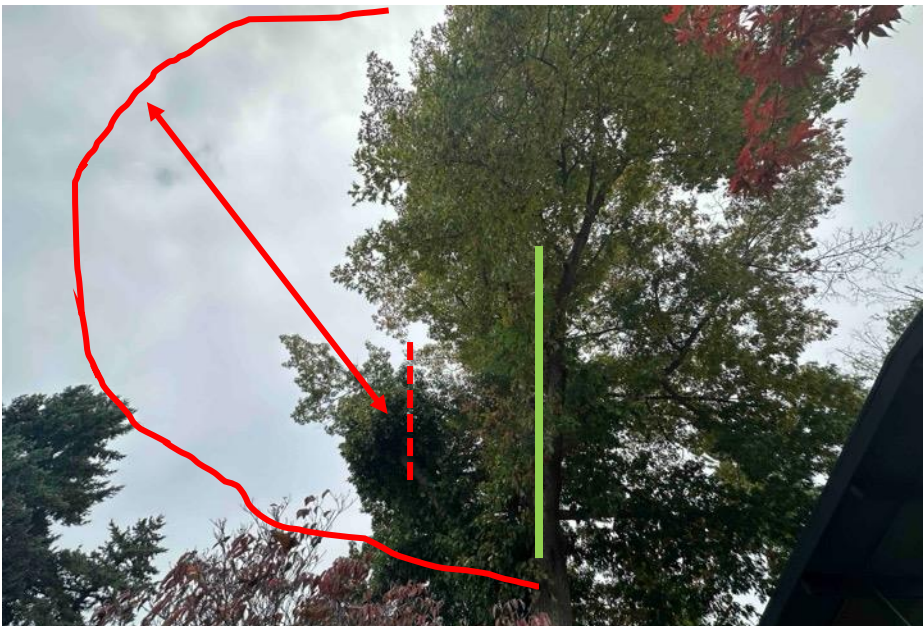
Photo 2: Red outline shows approximate area occupied by the topped stem. View is looking north. Image taken from the street. Red dashed line shows how far back the topped stem was cut. Arrow indicates the approximate distance from the trunk the stem was topped. Green line identifies the main trunk for reference.